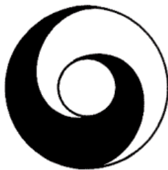
Figure 1-4. Yin and Yang derived from Taiji (Lai's Taiji Diagram)

In this book it states: "Ancestor Bao Xi (i.e., Fu Xi) as a king under the heavens, looked upward to observe the phases of the heavens. He looked downward to perceive the rules of the earth. He viewed the inhabiting birds and animal and their connection with the earth. Close adopt our bodies and far adopt various objects (i.e., he carefully observed our body's change, which is near, and closely inspected various natural phenomenon, which are far away from us, in order to figure out the rules or patterns of nature). He then began to create the Bagua, which is to be used to collaborate the decency of the divine enlightenment and to be used to classify the effects of ten thousand objects (i.e., the Bagua he created, could be used to draw the relationship between the heavenly nature and the millions of objects)". The Yi Jing is actually a scientific treatise based on detailed observations and careful contemplations, which produced an understanding of the patterns and rules of nature. Since nature is always repeating itself, it is possible through careful observation to deduce the rules of the natural patterns.